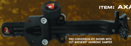
PRO CONVERSION KIT SHOWN WITH OUT MATHEWS® HARMONIC DAMPER